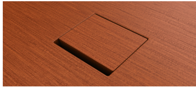
Cable Cubby 650 UT closed – Installed with a professionally-fabricated table-matching lid, it offers a discreet, architecturally-friendly design.