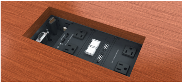
Two or more Cable Cubby 650 UT enclosures can be ganged together for a nearly endless selection of AV connectivity options.

The Cable Cubby 650 UT requires precision table cutting and professional carpentry skills for proper installation.